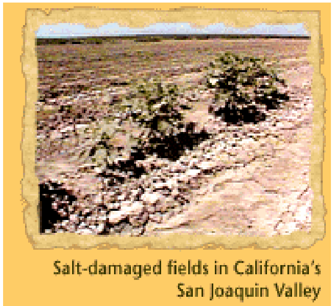
Salt-damaged fields in California's San Joaquin Valley

How did water from the Tigris and Euphrates become trapped on the fields?